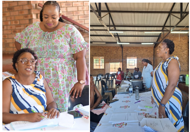
Municipal Officials during the indigent registrations.

Residents turned out in large numbers and were supported by municipal officials throughout the registration process. Officials guided community members through the completion of application forms, assisted with documentation, and ensured that registrations were handled in an organised and efficient manner.