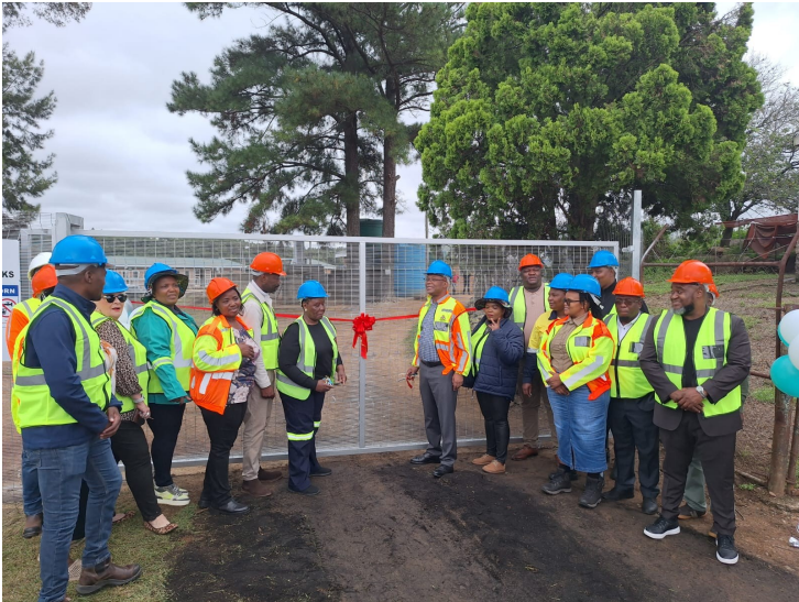
The Official Handover of the eMkhondo Water Treatments Plant .