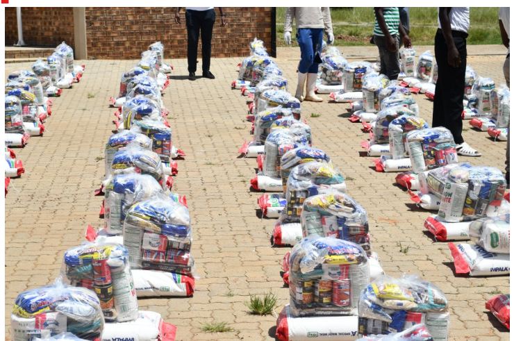
Relief Packs donated by Gift of the Givers.