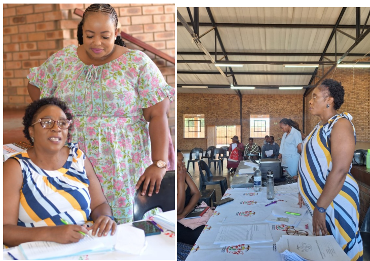
Municipal Officials during the indigent registrations.

Residents turned out in large numbers and were supported by municipal officials throughout the registration process. Officials guided community members through the completion of application forms, assisted with documentation, and ensured that registrations were handled in an organised and efficient manner.