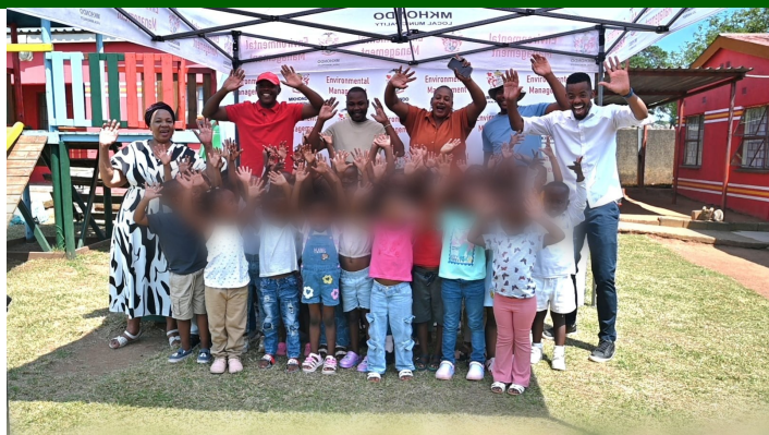
Officials from the Environment Unit at Bhekulwazi Day Care Center .

In commemoration of World Environmental Education Day, Mkhondo Local Municipality, through its Environmental Management Unit and Social Services, visited Bhekulwazi Day Care Centre on 26 January 2025.