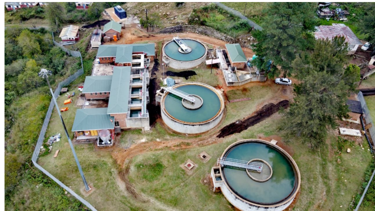
Newly Refurbished eMkhondo Water Treatment Plant.