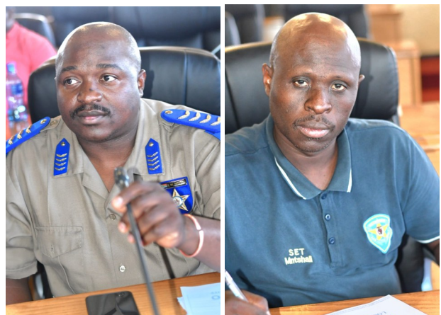
Law Enforcement officials during the meeting.

The meeting concluded by a proposed Working Committee to be formed among the transport operators, traffic officers and the municipality in order to work together to achieve the goal of public safety and promotion of safer roads.