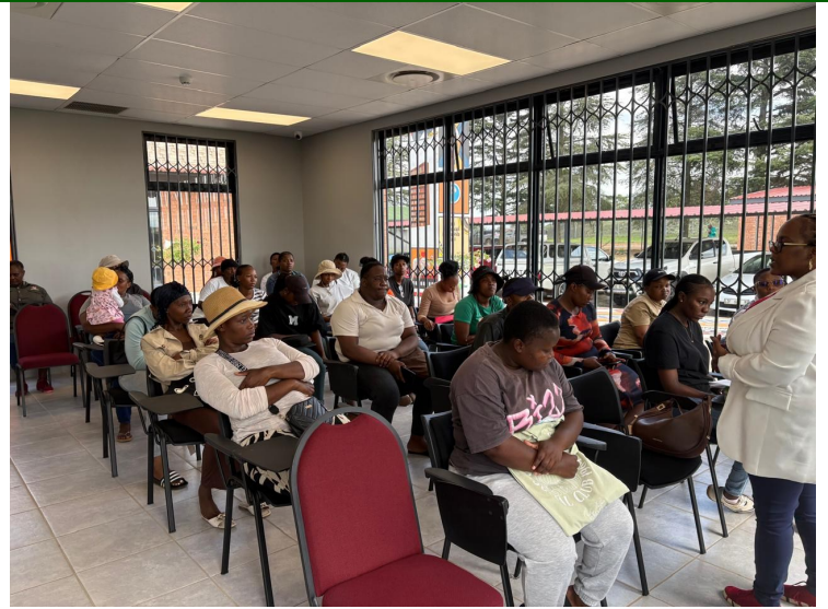
Stakeholders doing the presentations during the Empowerment Workshop.

The atmosphere at the Ethandukhanya Public Library was filled with energy and hope on 25 March 2026, as young people from across Mkhondo came together for a Youth Empowerment Workshop designed to shape their future.