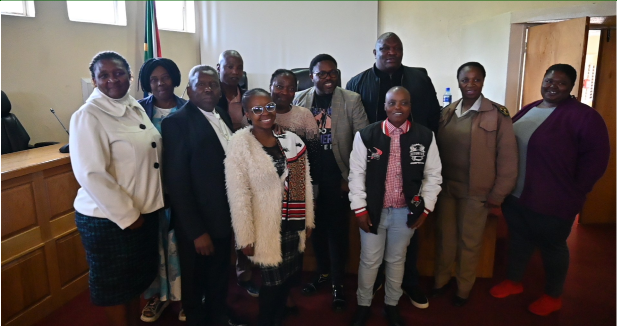
USomlomo kamasipala kanye nekomiti eliqokelwe ukwelekelela ukuvuselelwa kwezimilo.

Mhla Zingama 20 ku Masingana 2026, Ihhovisi lika Somlomo woMasipala waseMkhondo lihlele uhlelo lokuqokwa kwamalunga ekomiti azobhekelelela ukuvuselelwa kwezimilo eMkhondo.