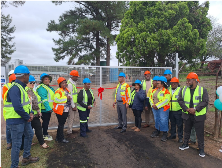
The Official Handover of the eMkhondo Water Treatments Plant .