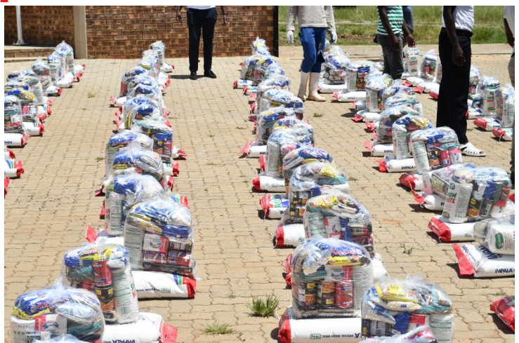
Relief Packs donated by Gift of the Givers.